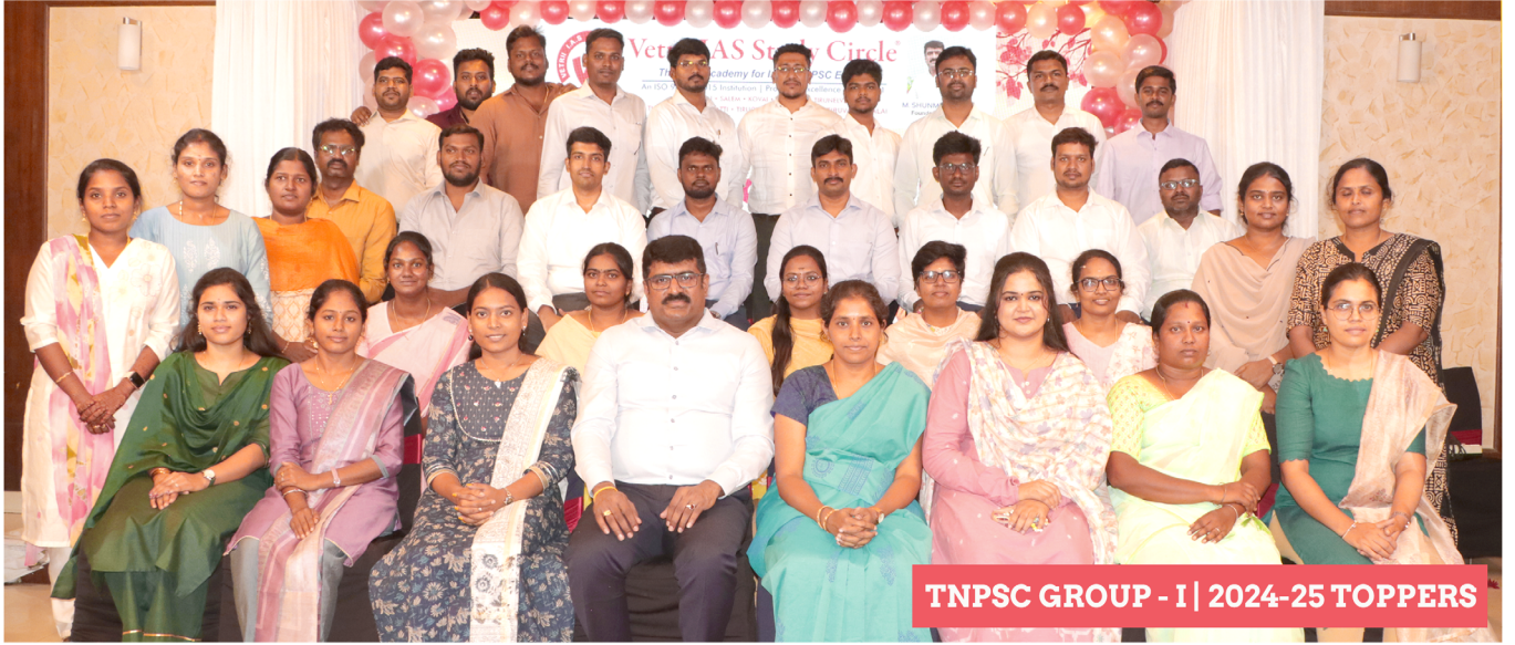
TNPSC GROUP - I | 2024-25 TOPPERS

2025 GROUP - I INTERVIEW CANDIDATES GR-I MAINS COURSE COMPLETELY FREE